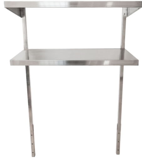
MROS-2RE / MROS-3RE

MROS-2RE / MROS-3RE / MROS-4RE MROS-5RE / MROS-6RE