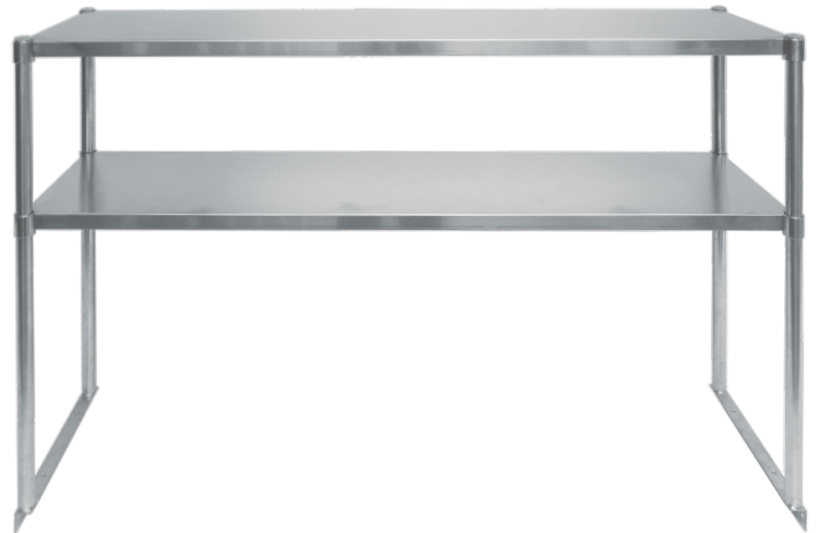
MROS-4RE / MROS-5RE / MROS-6RE