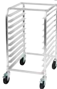
AWRK-10 ALRK-10BK NSF