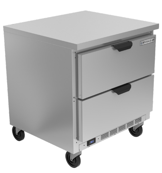
*Note: Shown with optional full electronic control