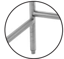
CROSS-BRACING Ensure Stability