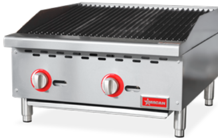
24 Inch #47377