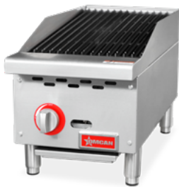
12 Inch #47376