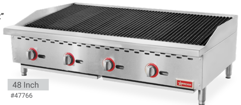
48 Inch #47766