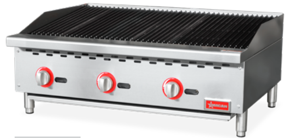
36 Inch #47378