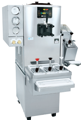
Optional cart with rear door for front mount syrup rail