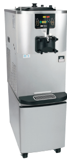
Optional cart with front opening door