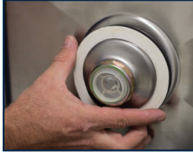
2. Add Fiber Washer