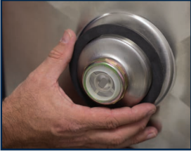
1. Add Rubber Washer