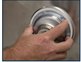
3. Screw on Die Cast Nut and Tighten