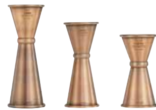
BAJ-9AC BAJ-8AC BAJ-7AC