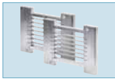
OS-250B Blade set assembly