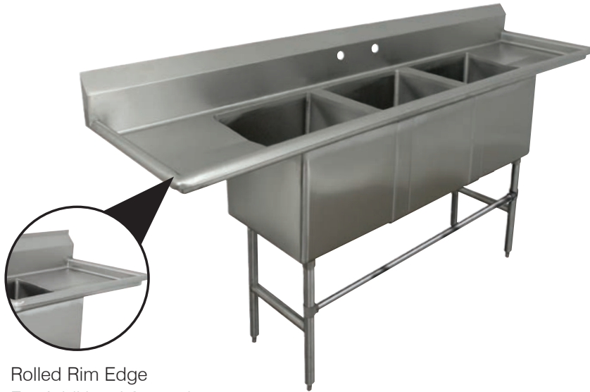
Rolled Rim Edge For Additional Strength