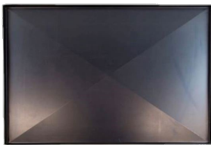
TAG6040 X Across Surface