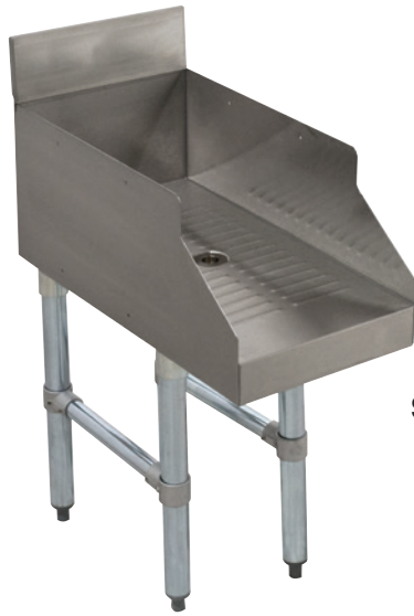
SL-GS Series 23" Wide Units