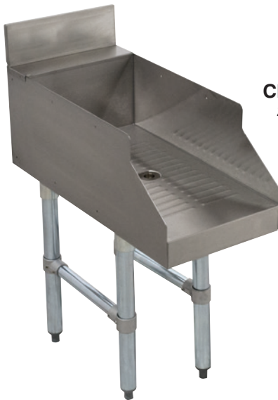
CR-GS Series 26" Wide Units