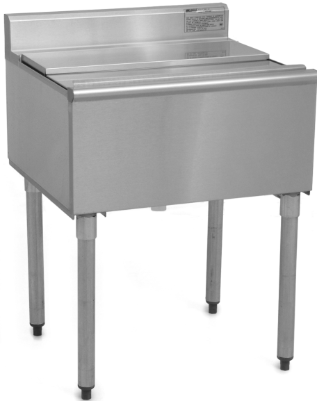
B2IC-22-7 ice chest

Eagle 2200 Series Ice Chests with Sealed-In Cold Plate, model _____. Top, front, backsplash and fabricated ice bin are heavy gauge type 304 stainless steel. Ice bin is fully insulated, with 1½" drain, and sealed-in 7-circuit cold plate. 1½" O.D. galvanized tubular legs with adjustable bullet feet.