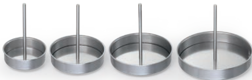
Optional changeable molds

Changeable mold 4" (3 1/2 to 5 oz.), 5" (5 to 8 oz.), 6" (10 to 14 oz.) 7", (12 to 16 oz.) patties