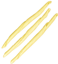
Maccheroni Al Ferro