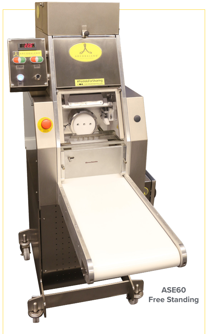
ASE60 Free Standing