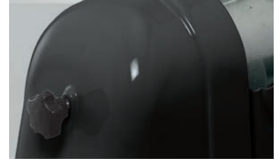
Cut thickness adjusting knob