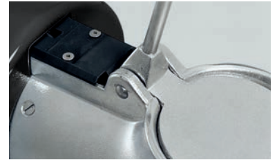
Microswitch on the lever