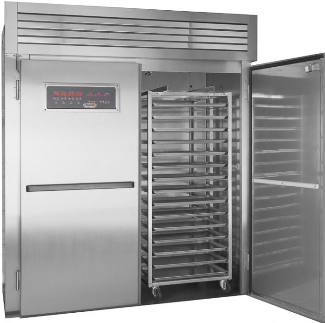
LRP2S-40 (rack not included)