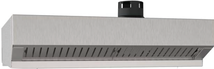
XAKHT-HCFS: Full Size Ventless System for Cadco Bakerlux LED/TOUCH Convection Ovens

UL evaluated under the KNLZ category "Commercial Cooking Appliances with Integral Systems For Limiting the Emission Of Greaseladen Air". Using EPA test method 202 emissions of grease laden vapor were measured at 0.24 mg/m 3 . Results are less than the established 5 mg/m 3 . Please allow 4 inches of clearance in the back and 2 inches of clearance on the side for proper airflow to maximize the performance and to prevent any issues or damages to the product.