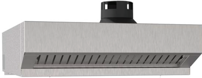
XAKHT-HCHS: Half Size Ventless System for Cadco Bakerlux LED/TOUCH Convection Ovens