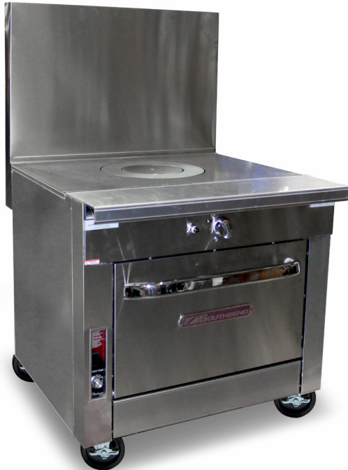
Model P36A-GRAD with optional 24" flue riser