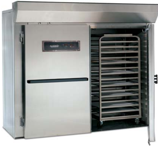
Model LRP3-40 Shown