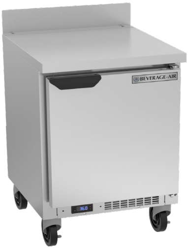
*Note: Shown with optional full electronic control

7 Year Parts/Labor Warranty 7 Year Compressor Warranty