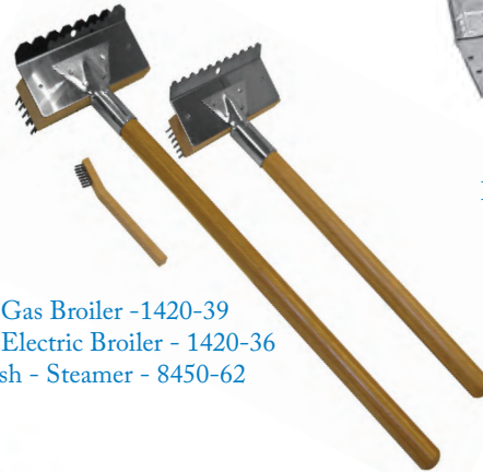
Grill Brush - Gas Broiler -1420-39 Grill Brush - Electric Broiler - 1420-36 Cleaning Brush - Steamer - 8450-62