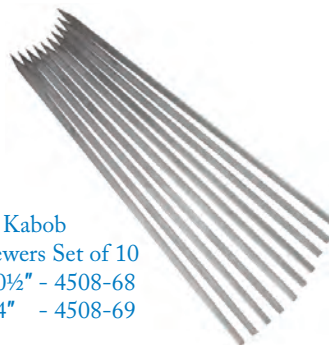
Shish Kabob Skewers Set of 10 20½" - 4508-68 24" - 4508-69