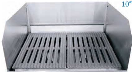
10" Splatter Guard 2070400 (E2424)