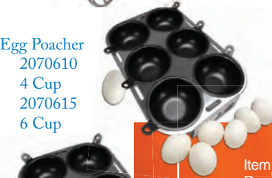
Egg Poacher 2070610 4 Cup 2070615 6 Cup