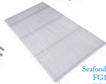
Seafood Veggie Grate FG1 - Model 25 FG2 - Model 31 FG3 - Model 41