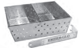
Demineralizer Kit 2090400