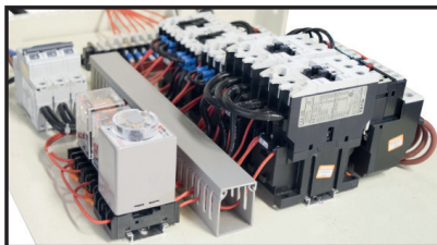
Reliable Electronics For Superior Service Life