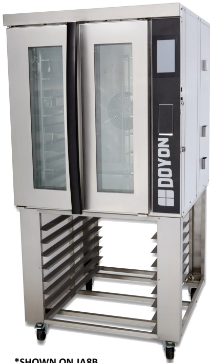
*SHOWN ON JA8B

PROJECT _____ ITEM NO. _____ NOTES _____ MODEL NUMBER: JA8X , JA8XG , JA8XR