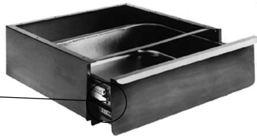
drawer assembly with NSF-approved slides