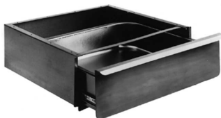
enclosed drawer assembly

* Holes are predrilled for 20" x 20" drawers only.