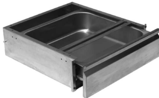
SPEC-MASTER® heavy duty drawer assembly