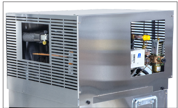
Reverse side showing water connections.