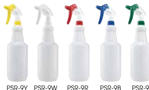
PSR-9Y PSR-9W PSR-9R PSR-9B PSR-9