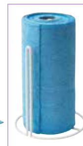
BTM-12B with WHW-12