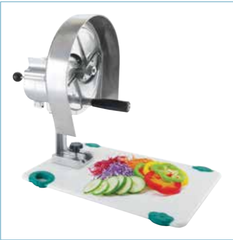
FVS-1 mounted and ready