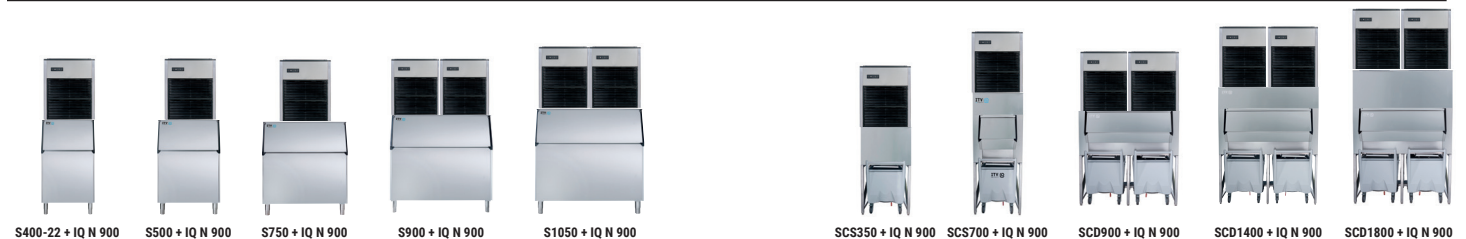
S400-22 + IQ N 900