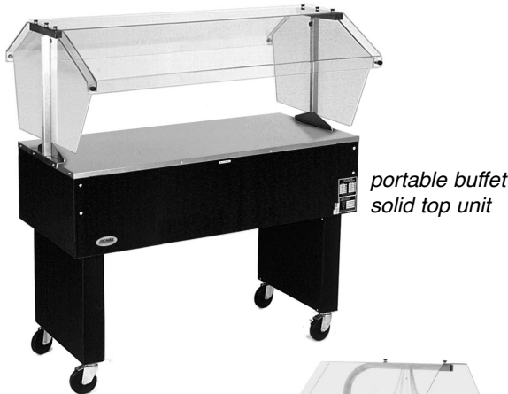
portable buffet solid top unit

Eagle Portable Buffet Cashier's Stand, model CS-1. Polished stainless steel top with black vinyl on steel body, enclosed on three sides with storage area under drawer, and stainless steel bottom panel. Stainless steel front mounted cashier drawer. 4" swivel casters, two with brakes.