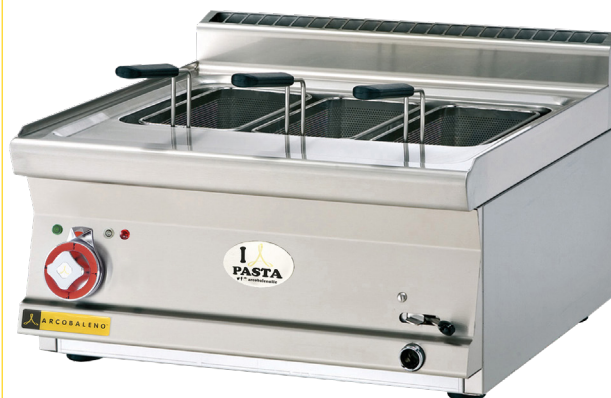
6.5 Gallon Tank APCT2424 APCT2525 "Maya"