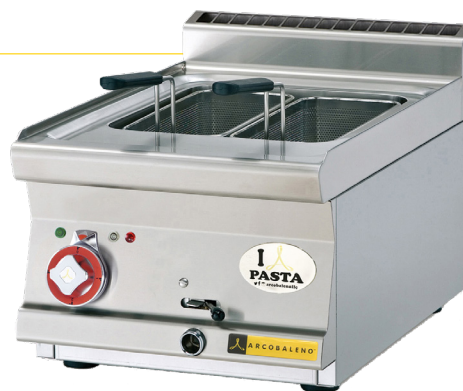
4.5 Gallon Tank APCT24 APCT25 "Elena"