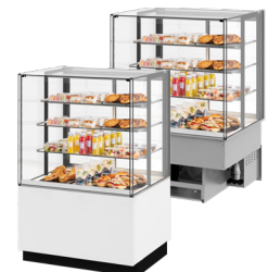
Models on underframe or drop-in version