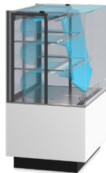
Patented Cold Booster technology