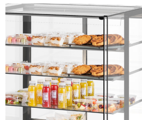
Maximum food visibility