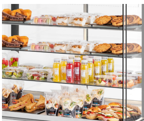
Four presentation levels