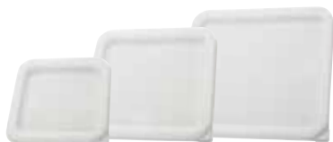
PECC-S, PECC-M, PECC-L