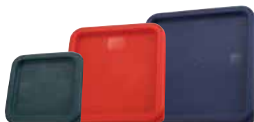
PECC-24, PECC-68, PECC-128