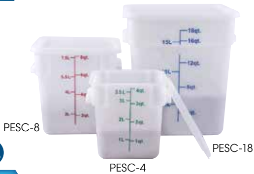
NSF ® BPA FREE PESC-SERIES