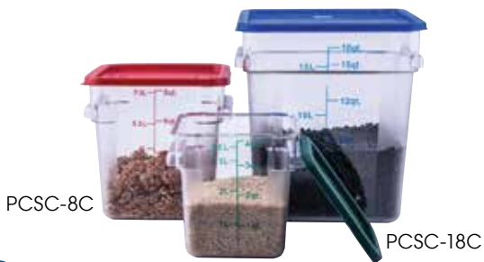
NSF ® PCSC-SERIES