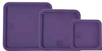
PECC-128P, PECC-68P, PECC-24P

Refer to Allergen-Free Utensils for purple handle collection