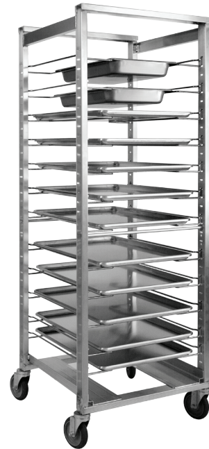
207-UA-13A (Pans not included)