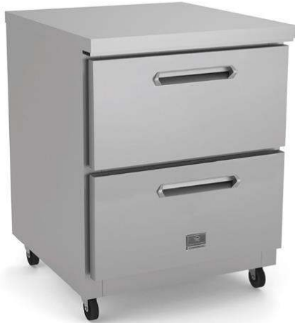
738337 (KCHUC272DR-32) 2-Drawer Under Counter Refrigerator 27" Long 32" Tall