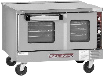
TVES/10SC shown with optional casters