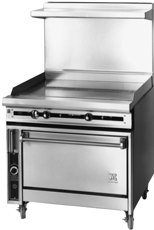
JTRH-36GT-36 with optional high shelf and casters