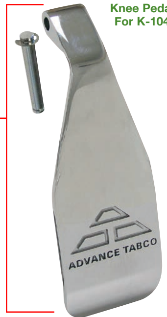
Chrome Plated Knee Pedal For K-104