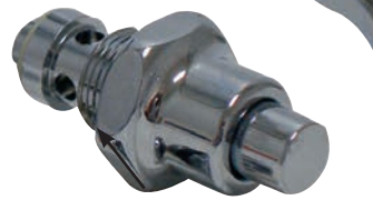
Bonnet Assembly K-01