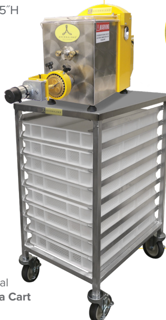
Optional APC8 Pasta Cart