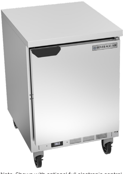
*Note: Shown with optional full electronic control

7 Year Parts/Labor Warranty 7 Year Compressor Warranty