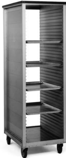
heavy duty rack with side panels

Eagle Panco Aluminum Rack with Side Panels, heavy duty model OR-1840. Constructed of 1" square tubular frame and support with 0.100"-thick aluminum die-formed top and bottom, with vinyl bumper around the top. Extruded aluminum corner posts riveted to top and bottom. ½"-diameter reinforcing rods. 1½" slide spacing to accommodate (40) 18" x 26" full size sheet pans. Furnished with 5"-diameter casters. Unit shipped assembled.