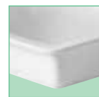
Reinforced edges & corners