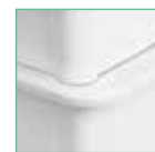
Seamless fit for fresh storage