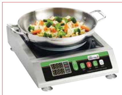
Using with SSOP Pan