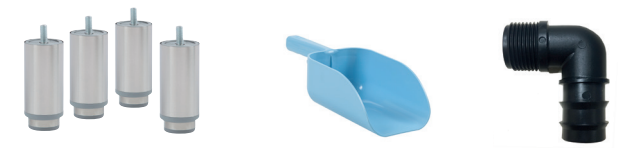
4 HEIGHT ADJUSTABLE LEG KIT SCOOP DRAINAGE ELBOW