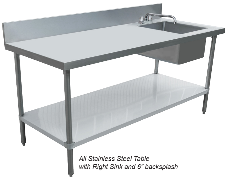
All Stainless Steel Table with Right Sink and 6" backsplash