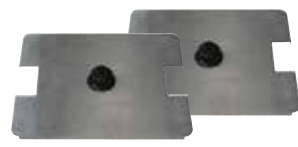
Cover(s) for well(s) included