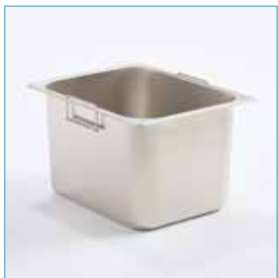
Lift drop handles to remove fry wells for easy cleaning