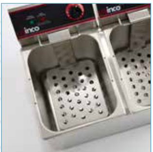
Each well holds 16lbs of oil