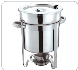
INSS-70F Fits Marmite Soup Chafer CAMS-107 (Sold Separately)