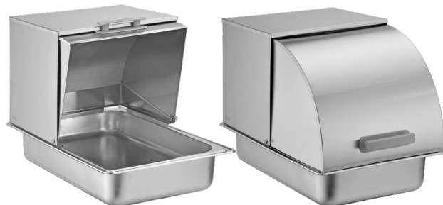
SSCR-F Used on a Full-Size Food Pan