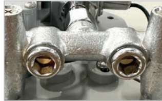
Adjustable Mixing Valve