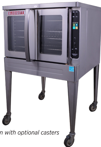
Shown with optional casters

Full-Size, Bakery Depth Dual Flow Gas Convection Oven