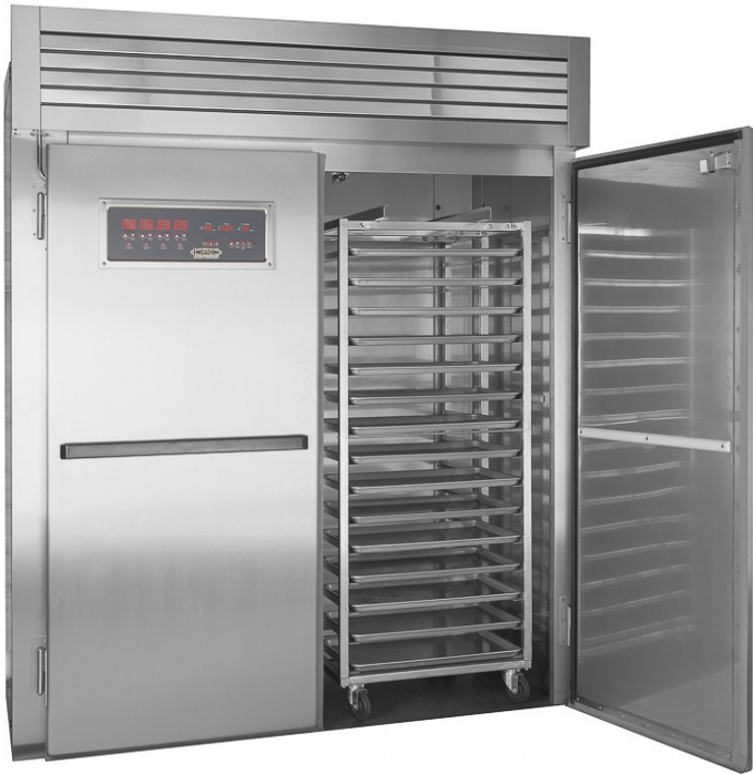
LRP2N-40 (rack not included)